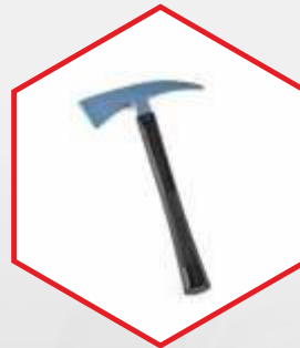
FIRE MAN AXE