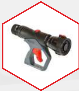
TRIGGER FLOW NOZZLE