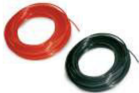
Heat Detection Tube